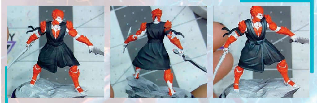
For the clothing, we cover with Matte Black. And for the base we use a reddish brown.

Next, we add a rich red (such as Carapace red) to all caparace areas. With a little black, we paint the eyes.