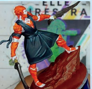
If you'd like to add some texture to the base, dry brush the rock with ivory or an off-white colour.