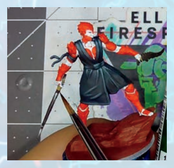
Paint the handle of the sword with Medium Tan.