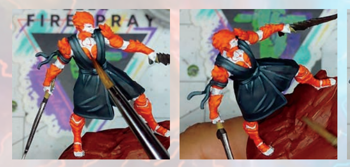
With a bright orange (mixing red & yellow), highlight some of the most raised areas of the caparace.